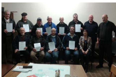
Level 1 Alcohol Awareness Training Tobecurry Men Shed 3 rd December 2014