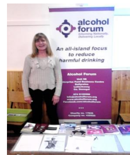
Milford Health Day2